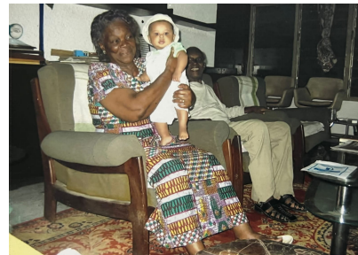
Quality time with grandma and grandad