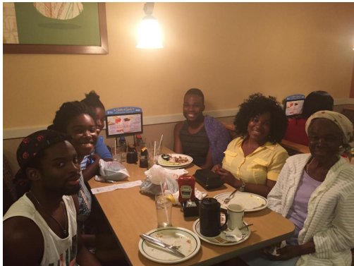
With her Grandchildren