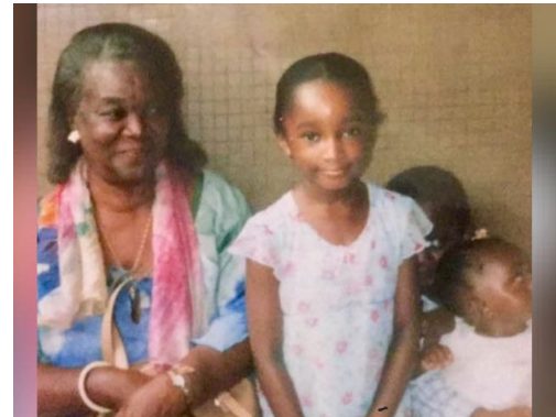
With her namesake