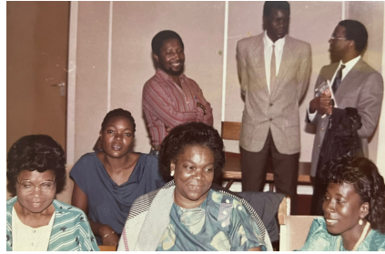
Spending time with friends in Nairobi Kenya