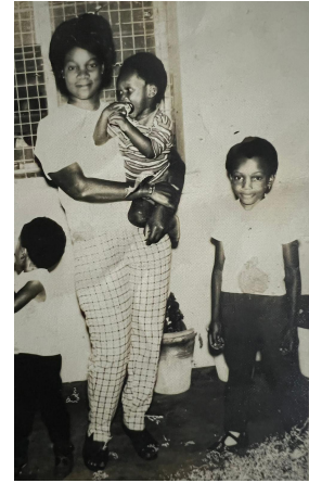
As a young mother with three children