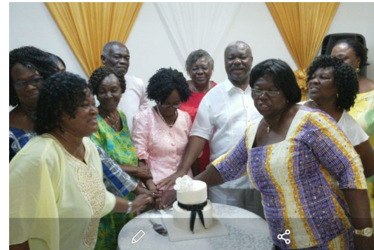
Spending time with siblings at a birthday party