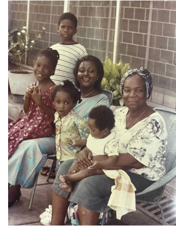
With daughter in law and grandchildren