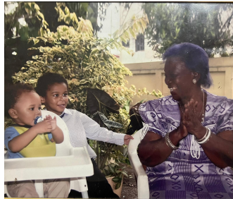
Getting excited about her grandchildren