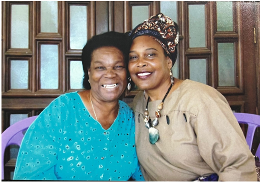
Go on have a laugh!