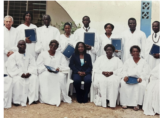
Citation ceremony- Church Universal Triumphant of Ghana